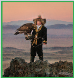
2016 IFF Audience Award Winner

Everyone who attends a Festival screening this year is invited to vote for their favourite film.