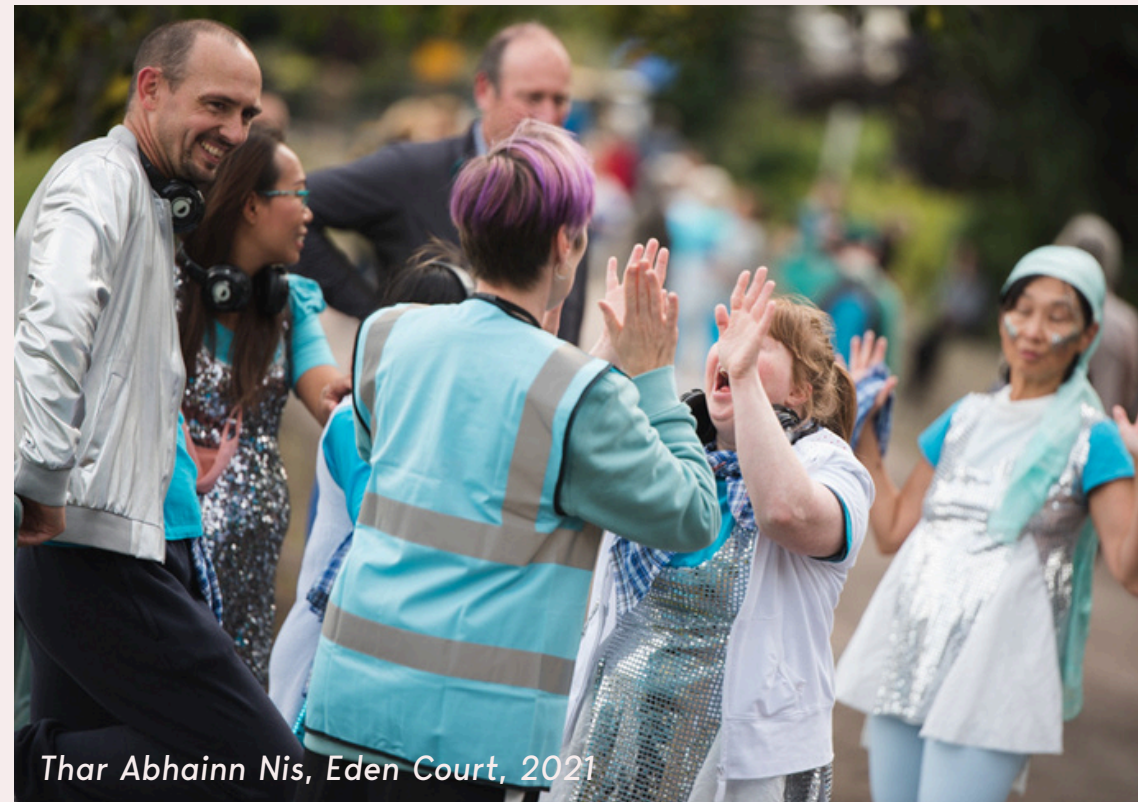
Thar Abhainn Nis, Eden Court, 2021

This commitment will be supported by a Climate Emergency Policy for all staff and an Action Plan for 2023 - 2025.