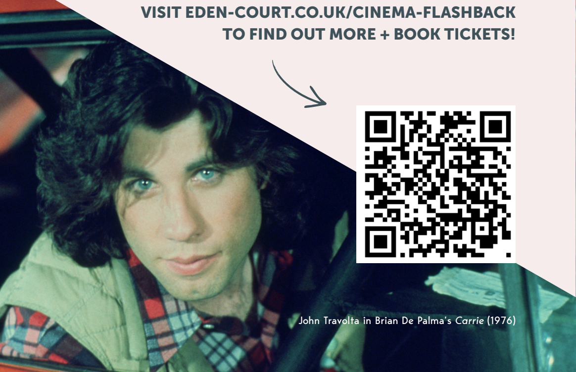
John Travolta in Brian De Palma's Carrie (1976)